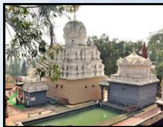
PARSHURAM TEMPLE 8 KM