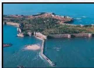
SINDHUDURG FORT 160 KM