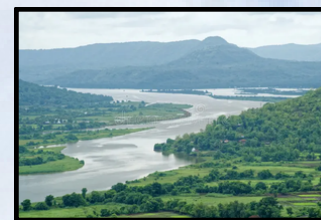
VASHISHTI RIVER VIEW POINT 8 KM