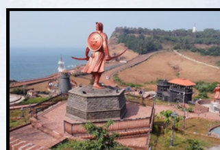
RATNAGIRI 95 KM