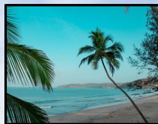
GUHAGAR BEACH 45 KM